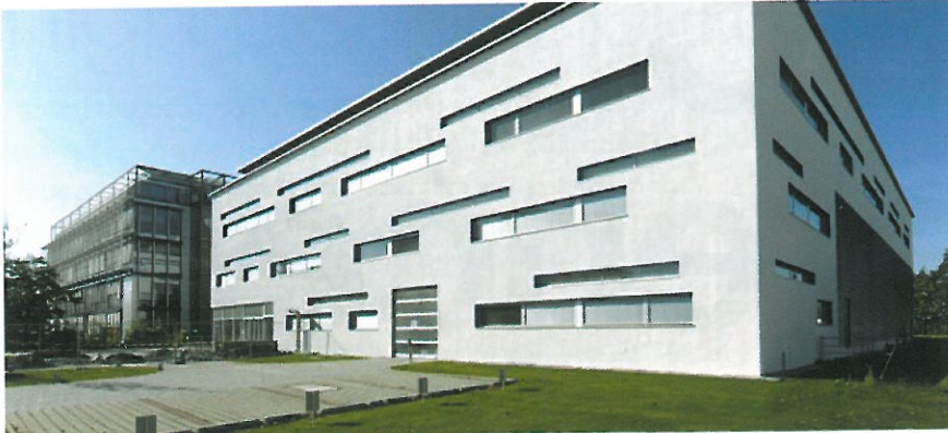
The new ASTRA Platform Services (APS) building in the Unterfoehring Media Park near Munich.

ASTRA Platform Services GmbH (APS), a subsidiary of SES ASTRA, operates in Unterfoehring near Munich, Germany, one of Europe's most modern broadcasting centres. When spatial capacities reached their limits, APS acquired a plot of land on the opposite side of the street and decided to connect the two sites via fibre cables. For the transmission of L-band signals, APS choose equipment from the Optribution product family by DEV Systemtechnik, Friedberg, Germany.