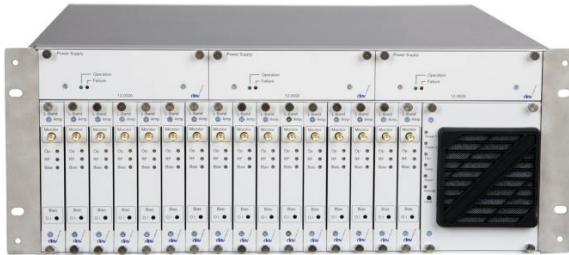
Front DEV 2190 (equipped with 16 Amplifier Modules)