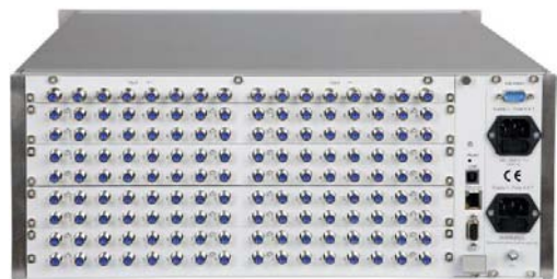
Rear DEV 2190 (equipped with 16 * Option 8/75)